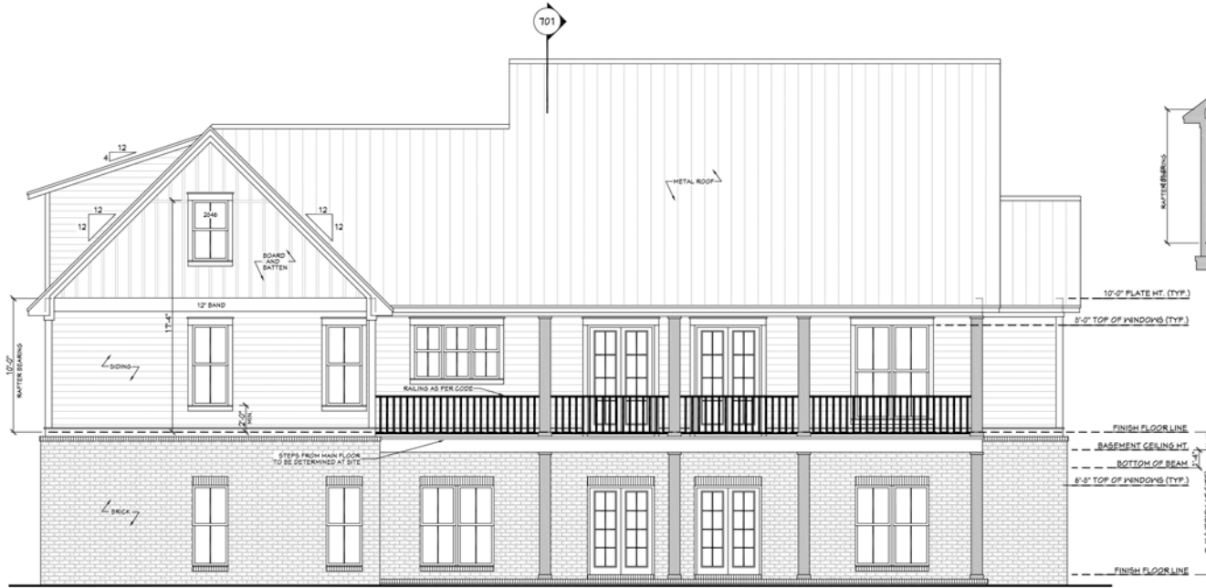
502 REAR VIEW SCALE.....1/4" = 1'-0"